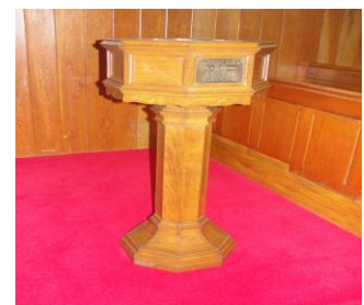
Font, Hutton Church