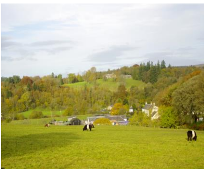
View from Hutton Church