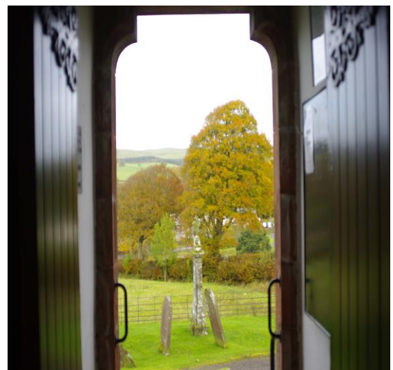
View from Hutton Church