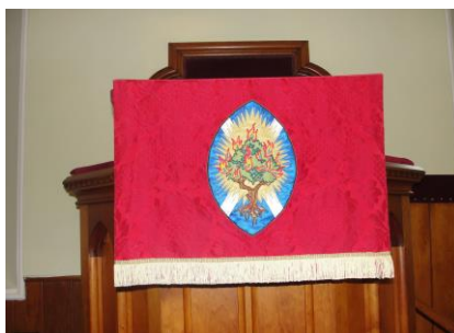
Pulpit Fall, Hutton Church