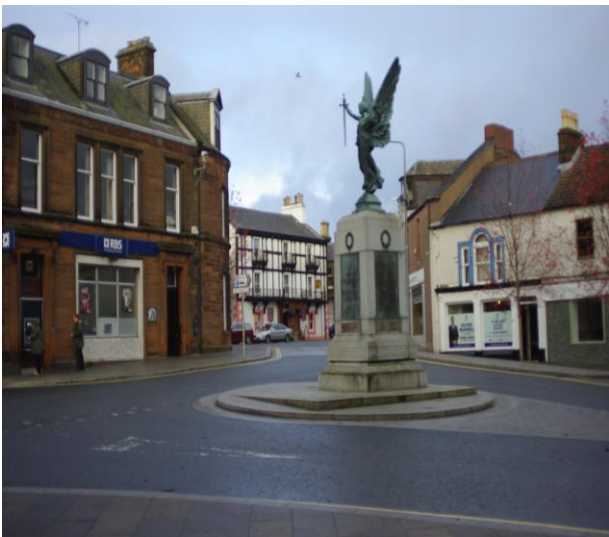
Lockerbie High Street