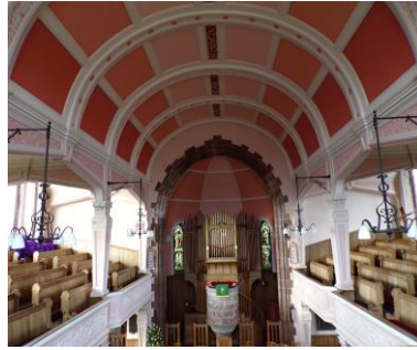
Dryfesdale Church Gallery