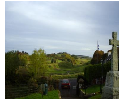
View from Hutton Church