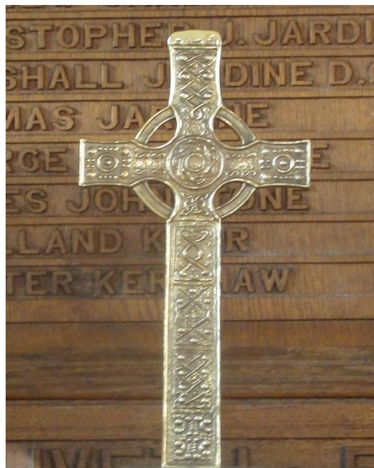
Cross in Memorial Aisle, Dryfesdale Church